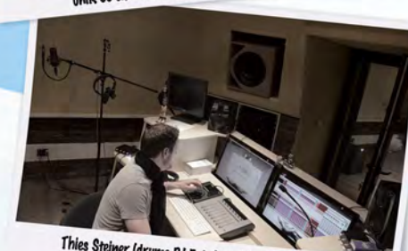
Thies Steiner (drums PJ Bobo) at H2U Studio in Thun, Switzerland, equipped with unik 05 and unik 08

Top Quality 5" Studio Reference Monitor - build upon the legacy of our successful nEar05 models, aktiv 05 takes 5" near field monitoring speaker on a budget to yet another level. The monitor boasts and ultra-flat low frequency response with its newly designed larger silk dome tweeter and the enhanced kevlar 5" driver delivers accurate low-mid frequencies