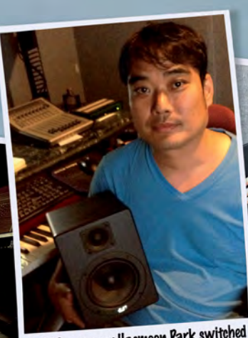
K-POP composer Haemoon Park switched from nEar05 to the improved aktiv 05